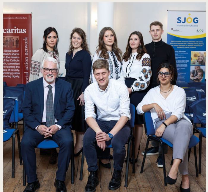
Homes for Ukraine team

“Great and fruitful day! Thank you for the food for thought and for the food.”