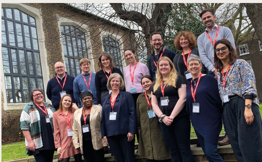
Aspiring Leaders Cohort 2 at the Royal Foundation of St Katherine in London

Participant in Aspiring Leaders Programme, Cohort 1