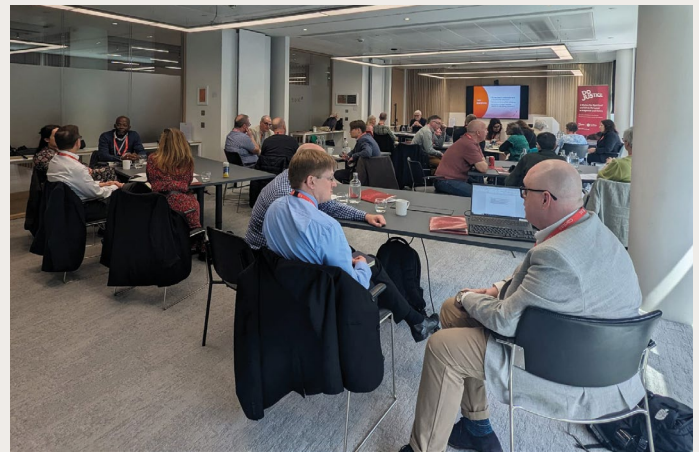
CSAN Leaders in Conversation at CCLA