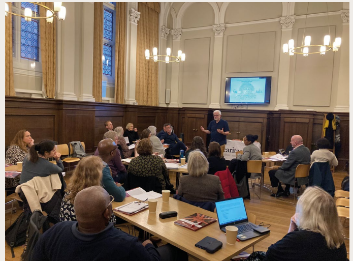
CST training day at the London Jesuit Centre

In June 2024 we celebrated the final event in our Homes for Ukraine programme for which we have partnered with CSAN member, St John of God Hospitaller Services. Since the programme began in 2022 in response to the invasion of Ukraine and the displacement of millions of Ukrainian people, around 140 Ukrainian guests were matched with hosts in this country, with most having arrived, some awaiting visas. This project was supported by funds from the Albert Gubay Foundation and the Department for Levelling Up Housing and Communities.