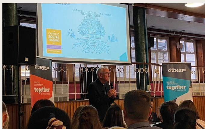
Cardinal Vincent Nichols addresses the Citizens UK conference for Catholic schools